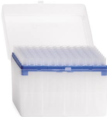
Finntip Filter 1000 µl sterile